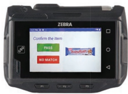
Voice or Touch Screen Pick Confirmation