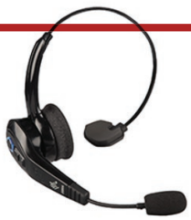
Victory Voice Picking 50% Productivity Boost