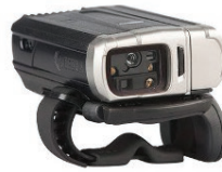
Scan Validation 99.98% Accuracy